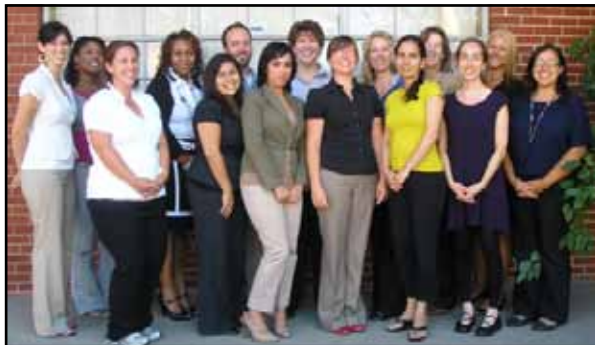
Members of Between Friends' Staff